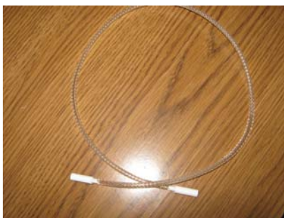
18 inch long Nafion tube

The SRI Gas Stream Dryer ( SRI part# 8670-5850 price: $636) (2022 pricing, prices subject to change, consult most recent price list) is able to substantially eliminate water vapor from a flowing gas stream. The dryer is constructed from a Nafion tube which is buried in a plastic tub full of indicating molecular sieve.